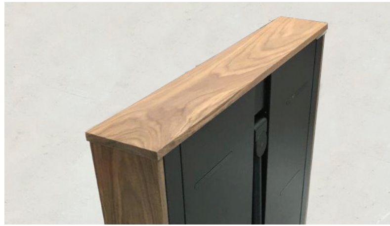
Shown: Fastlane Plus 400 MA with custom wood finish

Extend design beyond color and materials. Fastlane turnstile pedestals can also be customized to enhance the look and feel of your lobby even further. Pedestals can be created longer, wider, taller or in different shapes depending upon your architectural requirements.